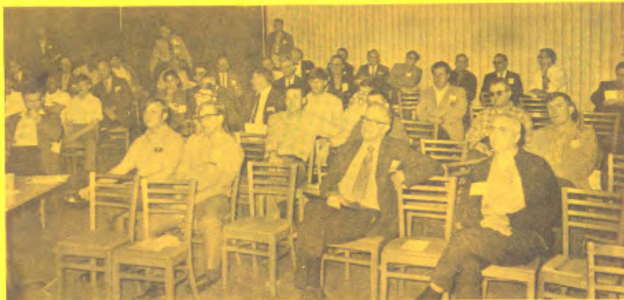
MWARS MEETING DAYTON